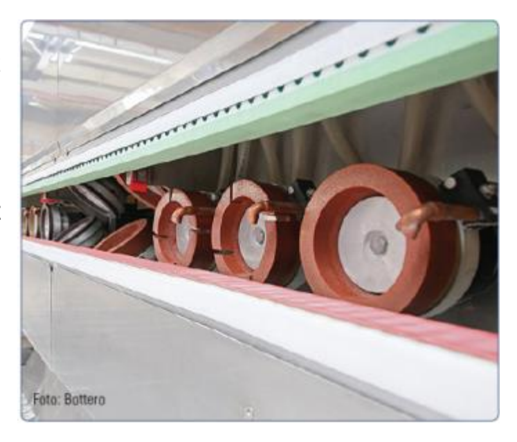
KOLLMORGEN drives allow the precise positioning of the glass sheets and the drive of grinding wheels.

ferent fields of application. The whole system is controlled by an intelligent AKD PDMM system with integrated PLC and motion control functionalities. which combine the qualities of the actuators with the most advanced functions for sequential and movement control. In Bottero plants, the AKD PDMM performs two main drive tasks: the positioning of the glass sheets and the drive of a grinding wheel. In addition, the device is also used to control the drive system with 9 AKD series drives. Thanks to its rapid regulation circuits and to the powerful control unit, the KOLLMORGEN automation platform provides ideal conditions to en-