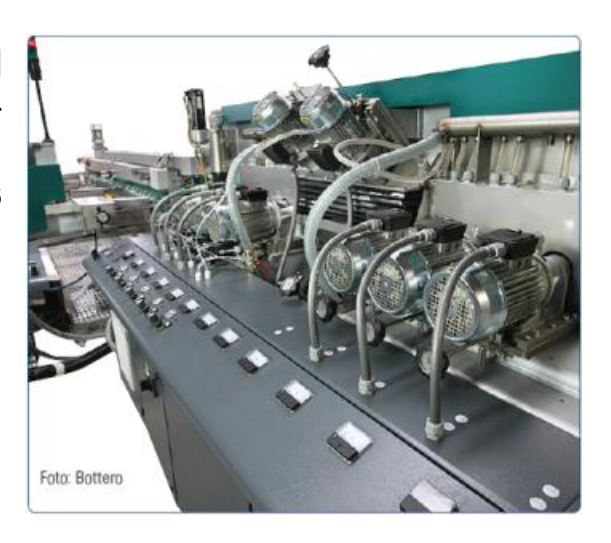
Bottero plants follow the current market trend that prefers small batch sizes.

provide high-tech and extensive know-how in all areas of machine construction for glass processing. Bottero builds full plants for processing of laminated and monolithic flat glass, as well as for the production of glass containers.