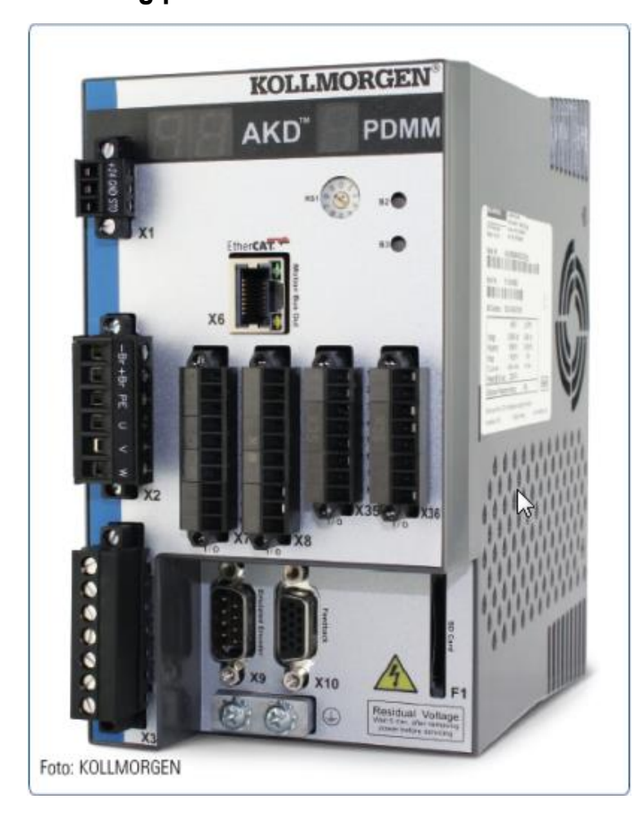
Integrated IPC: the freely programmable AKD PDMM drive.

As soon as the task was completed, the respective parameters of the motor are transmitted by the central AKD PDMM through the EtherCAT Ethernet bus in real-time. The drives support communication through I/O connections on the device. In the configuration developed in collaboration with KOLLMORGEN, the drives feature 75 digital inputs, 22 digital outputs and 10 analog inputs and outputs, respectively. With this "on board" technology, Bottero saves 30% of decentralized I/O systems, reducing the hardware and installation costs, as well as space in the control cabinet.